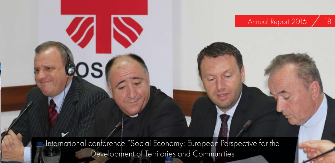
International conference "Social Economy: European Perspective for the Development of Territories and Communities"